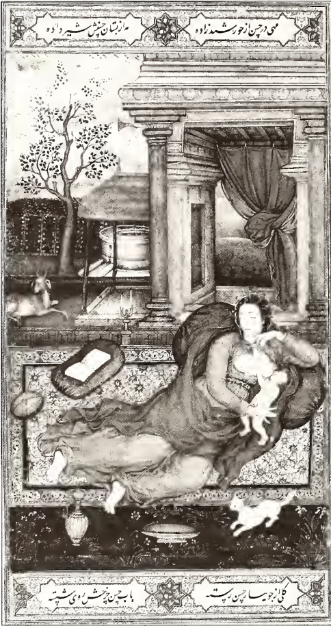
Figure 14. Modonno ond Child , attributed to Basawan (act. 1560–1600). India, Mughal period, Akbar period, ca. 1585–90. Album page; opaque watercolor and gold on paper, 40.37 x 24.37. San Diego Museum of Art; Edwin Binney 3d Collection